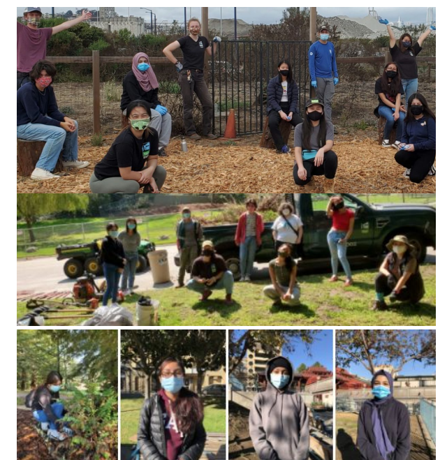
The Greenager Program

The Port of SF and the SF Recreation and Parks Department have teamed up to offer hands-on education programs for youth and public participation opportunities for visitors of all ages.