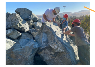
Boulder donated by CEMEX from Mt. Diablo quarry

Locally sourced and repurposed for nature play